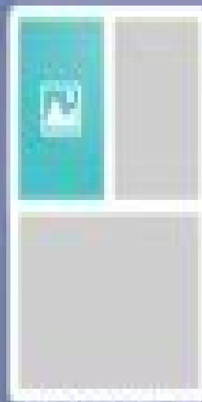
1/4 Page Color