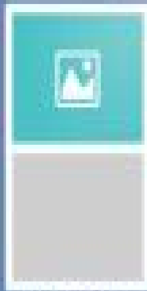
1/2 Page Color