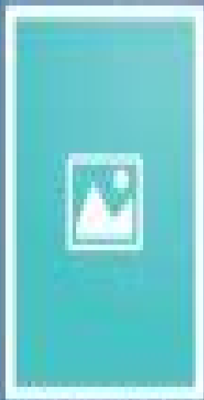
Full Page Color