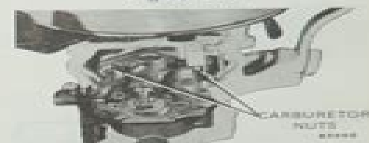
Figure 3-4. Carburetor Attaching Nuts