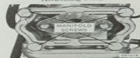
Figure 3-4A. Manifold Attaching Screws