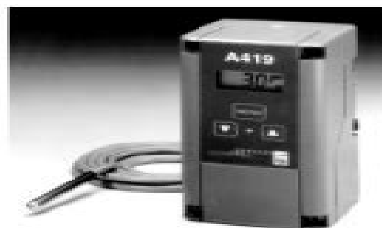
Figure 1: A419 Temperature Control with NEMA 1 Enclosure and A99 Temperature Sensor

The A419 controls have heating and cooling modes, adjustable setpoint and differential, an adjustable anti-short cycle delay, and a temperature offset function. The setpoint range is -30 to 212°F (-34 to 100°C). The controls feature remote sensing capability and interchangeable sensors. The A419 controls are available in either NEMA 1, high-impact plastic enclosure suitable for surface or DIN rail mounting or NEMA 4X watertight, corrosion-resistant surface-mount enclosures.