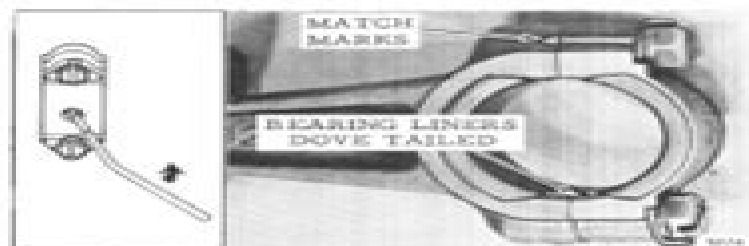
Figure 5-24. Checking Connecting Rod Cap Alignment

h. Bend lock plates up to prevent connecting rod cap screws from loosening and backing out.