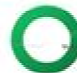
Annual Completion Rate