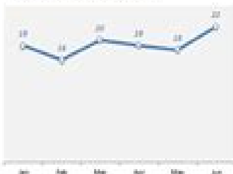
Timewriting Cost 2012 ($m)