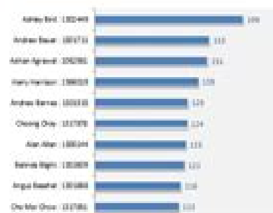
Annual Leave Days