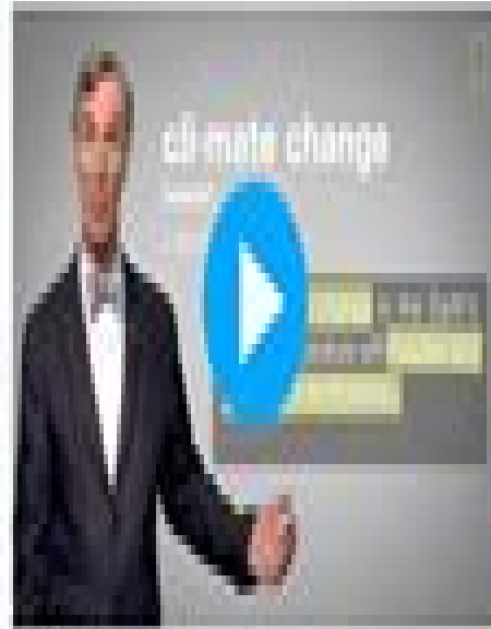
All About Climate Change