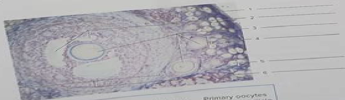
FIGURE 60.13 Label the micrograph of a section of an ovary, using the terms provided.