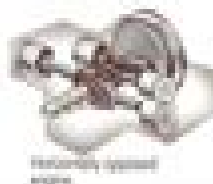
Horizontally opposed engine