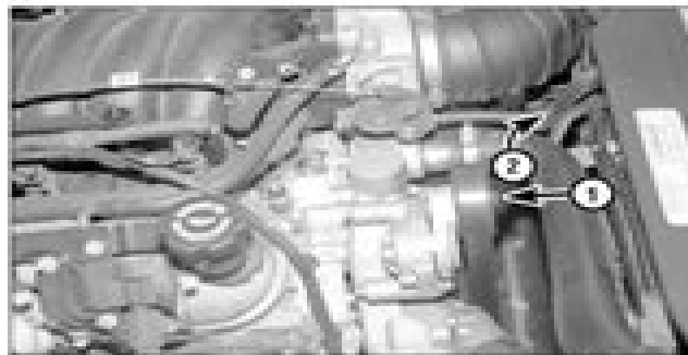
24.11 To remove the drivebelt, rotate the tensioner bolt (1), clockwise (2) to relieve belt tension (2007)