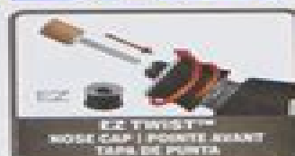
EZ TWIST™ NOSE CAP | POINTE ENANT TAPA DE PUNTA

Kit de almacenamiento de accesorios de uso general