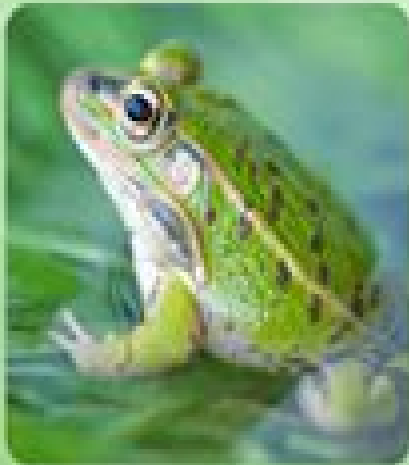
FROGS / TOADS

Amphibians are cold-blooded vertebrates that lack scales.