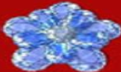
1 Rainbow Flower