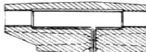
Axle pivot (Cast iron I-Beam axle)

NOTE: On tractors with a cast iron I-beam axle, the pivot is lubricated through a single grease nipple located centrally on the underside of the axle as shown.