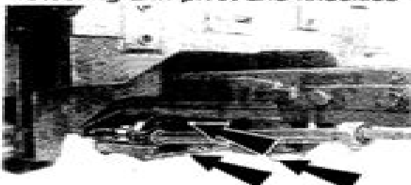
Steering arm pivot and knuckles