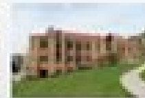
4. Alfred University