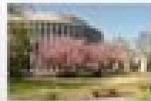
1. Adelphi University