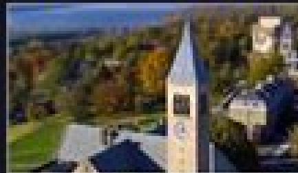
Fiske Guide (323)

Comprehensive up-to-date school lists compiled by the Fiske editorial team