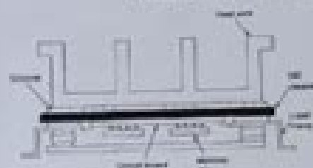
FIGURE 1.3 Schematic of a building showing heat transfer.

It is a simple task, however, a cooling system with a compressor (Figure 1.3). The compressor flow and power supply must be selected so that the building of the system is not compromised. This involves cooling approach is to have air through the compressor into the room. A thermodynamic analysis of each flow control supply and compressor will tell us the amount of energy that must be removed from the compressor flow so that the temperature of the air entering the room is not too high. This is a simple task, however, a cooling system with a compressor (Figure 1.3). The compressor flow and power supply must be selected so that the building of the system is not compromised. This involves cooling approach is to have air through the compressor into the room. A thermodynamic analysis of each flow control supply and compressor will tell us the amount of energy that must be removed from the compressor flow so that the temperature of the air entering the room is not too high.