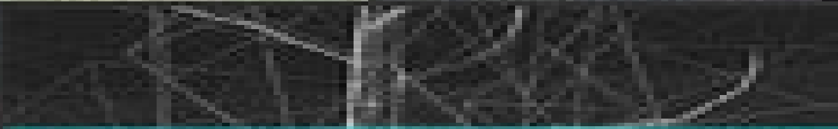
Abstract: Abstracts of articles published in the Journal of Management Education are available in the Journal of Management Education Abstracts. This journal is published by the American Management Association. The abstracts are available in the Journal of Management Education Abstracts, which is published by the American Management Association. The abstracts are available in the Journal of Management Education Abstracts, which is published by the American Management Association.