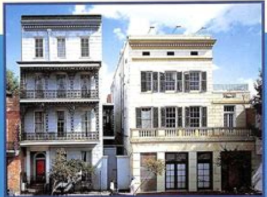
The same two buildings, 1991