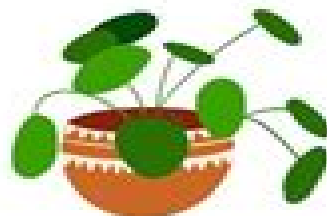
CHINESE MONEY PLANT