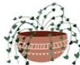
STRING OF HEARTS