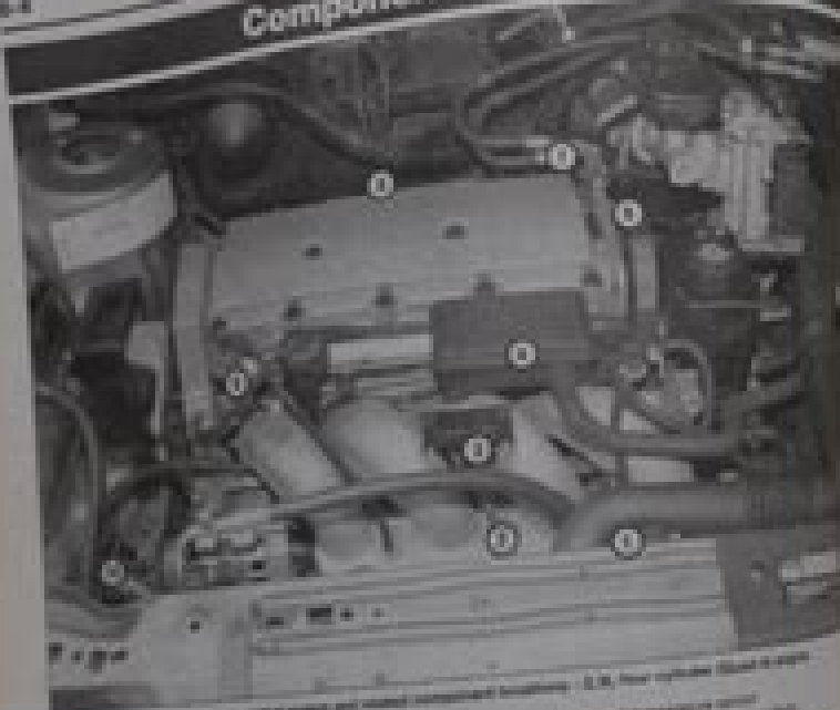
Exhaust control system and related component locations - 2.0L four-cylinder (Bolt) engine