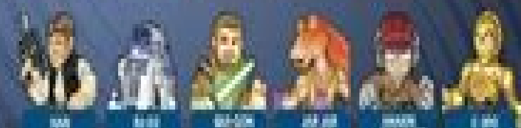
HAN SOLO R2-D2 CHIEF OF THE REBELS LEIA ORGANA HAN SOLO LEIA ORGANA