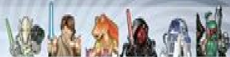
CHIEF OF THE REBELS LUKE SKYWALKER LEIA ORGANA HAN SOLO OBI-WAN KENOBI AHSAKA TANO