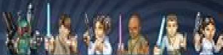
CHIEF OF THE REBELS LUKE SKYWALKER LEIA ORGANA HAN SOLO OBI-WAN KENOBI AHSAKA TANO