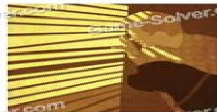
Turner & Hooch