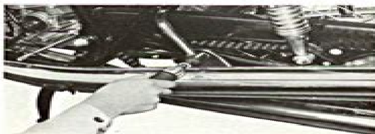
Fig. 7-1-22 Removing rear footrest