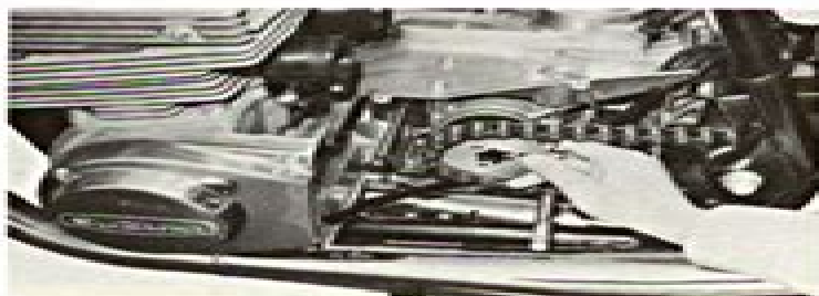
Fig. 7-1-20 Removing drive sprocket