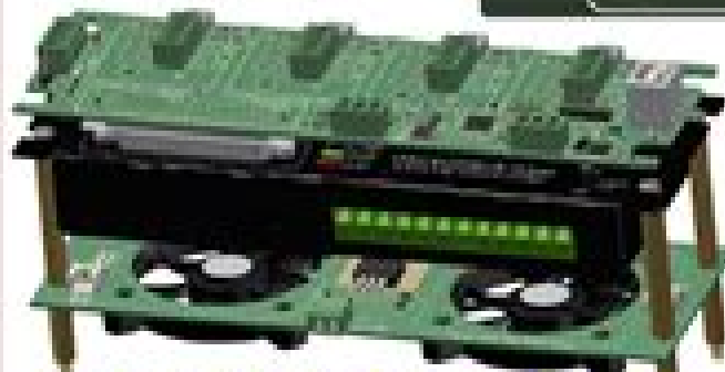
GRBL G540 shown installed atop gecko G540 and fan plate