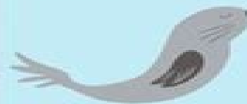
Seal or Sea Lion