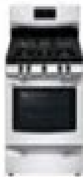
Kenmore 74133 5.0 cu. ft. Freestanding Gas Range w/Variable Self-Clean -...