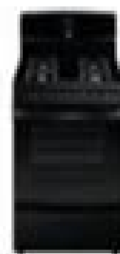
Kenmore 74419 4.2 cu. ft. Gas Range with Broil & Serve Drawer - Black