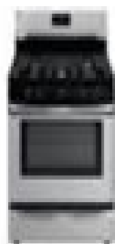
Kenmore 74423 4.2 cu. ft. Gas Range with Broil & Serve Drawer - Stainless...