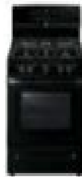
Kenmore 74129 5.0 cu. ft. Freestanding Gas Range w/Variable Self-Clean -...