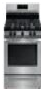
Kenmore 74433 5.0 cu. ft. Self- Clean Gas Range - Stainless Steel