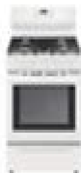
Kenmore 74452 5 cu. ft. Gas Range with Convection - White