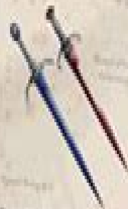
Sword of the Dragon Riders

When a dragon is born, it is a small, helpless creature. It needs to be fed, and it needs to be protected. It is the duty of the Dragon Riders to care for the dragons until they are old enough to fend for themselves. The dragons are the most powerful creatures in the world, and they are the most loyal. They are the only creatures that can fly, and they are the only creatures that can breathe fire.