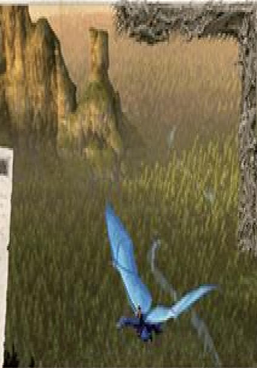
Sword of the Dragon Riders

The Dragon Riders are the most powerful creatures in the world. They are the only creatures that can fly, and they are the only creatures that can breathe fire. They are the most loyal creatures in the world, and they are the most powerful. They are the only creatures that can fly, and they are the only creatures that can breathe fire.