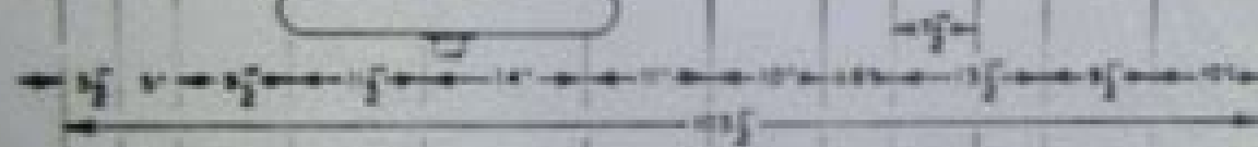
PLAN VIEW OF BODY SHOWING FRAMES IN PLACE AND STRINGERS LAID ON LEFT SIDE SEAT STEP ANGLE IRON