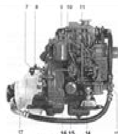
MD2020A & MD20