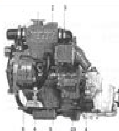
MD2010A & MD20