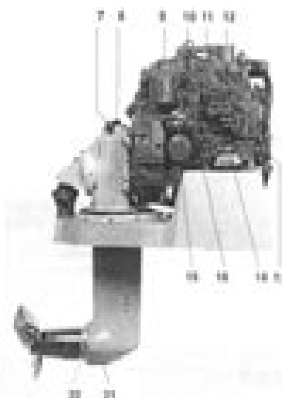
MD2020A & MD20