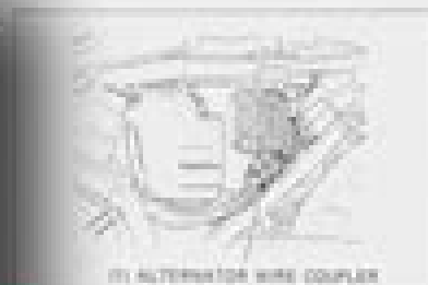
63 ALTERNATOR WIRE COUPLER

Back the stator up until it contacts the rotor and lock it.