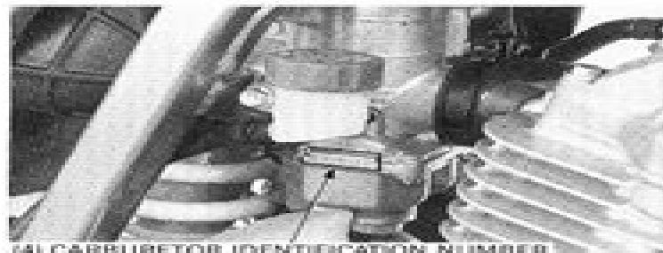
(4) CARBURETOR IDENTIFICATION NUMBER

The frame serial number is stamped on the right side of the steering head.