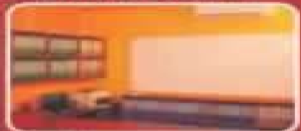
Learning facilities at Benchmark

Benchmark is focused on exceptional academic performance. Parents/Guardians are invited to arrange an appointment with the Director-Academic for an initial discussion.