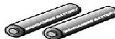
Batteries for Remote Control Handset. Type AA or UM3 or R6.