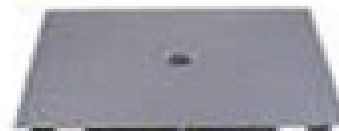
Rear LCD Lid