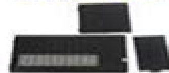
Plastic Doors & Covers