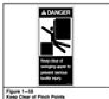
Figure 1-58 Keep Clear of Peak Points

The swing brake pedal is used to stop rotation of the upper over the carrier. To apply the swing brake, push down on the swing brake foot pedal. To release the swing brake, release the swing brake foot pedal.