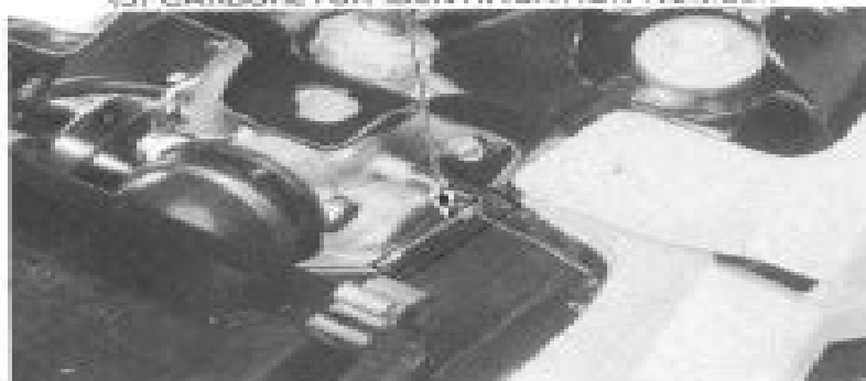
(3) CARBURETOR IDENTIFICATION NUMBER

The carburetor identification number is stamped on the