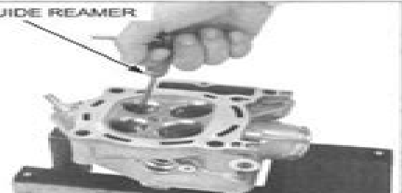
VALVE GUIDE REAMER

Measure and record each valve guide I.D. in the combustion chamber.