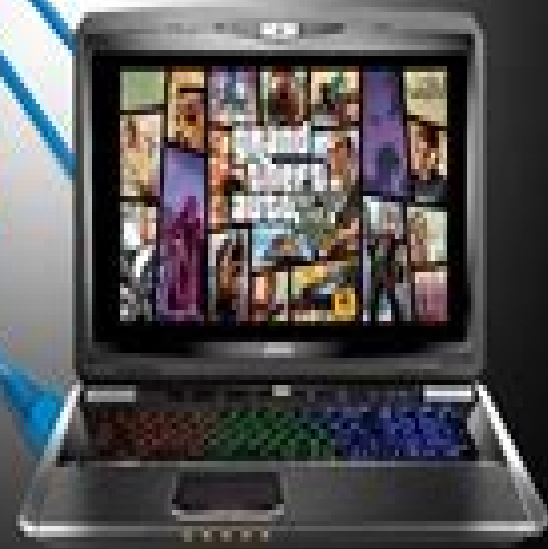
GTA V Ultra 1080p Frames Per Second