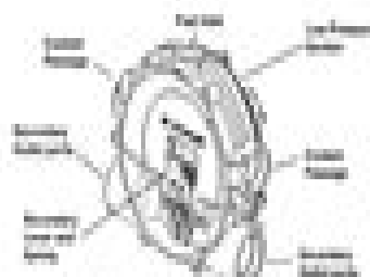
Figure 3-117: Low Pressure Regulator

For best use, the fuel line to the engine is an internal carbon steel line. Carbon steel is the only material that can handle the high pressure and temperature of the fuel line.