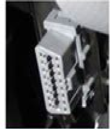
MIMAMORI Download Connector (10 Pin)