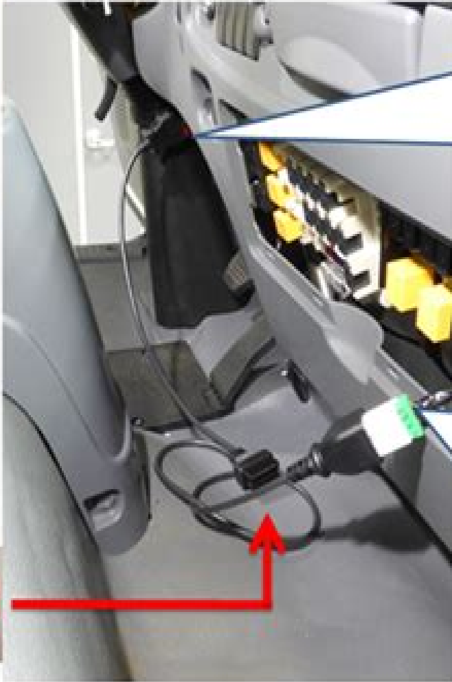
DLC (16 Pin)