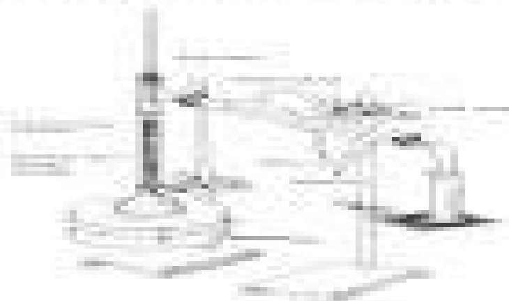
Keywords: child sexual abuse; disclosure; disclosure strategies