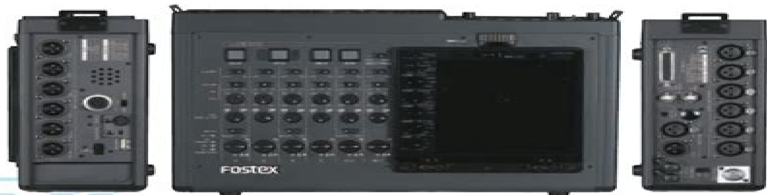
DVD LOCATION RECORDER WITH TIMECODE

not only simple stereo mixing of all six channels, but also by using a combination of the mixers, parallel mix signals tracks can be made whilst recording of either five tracks (mono guide track) or four tracks (stereo guide track). We call these "3+3" and "2+4" recording modes as separate 50% files are created. Additional features such as PFL, monitoring and peak led indication on each channel complete this very flexible mixer.