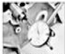
Fig. 1 Checking the camshaft endfloat using a 0.05 gauge

14 Lubricate the camshaft and cylinder head.