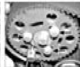
Fig. 1.8 Remove the camshaft-to-belt belt