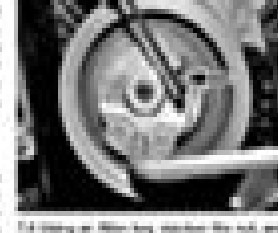
Fig. 1.8 Timing belt removal. The belt, and remove the high-pressure fuel pump sprocket and a 0.05 mm gauge will be used to check the timing belt.