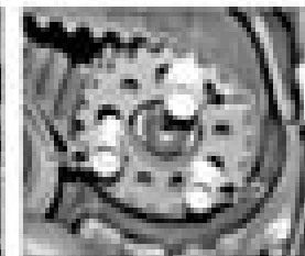
Fig. 1.8 Remove the high-pressure fuel pump sprocket belt

15 In the 'locked' position as described in the last removal procedure, the timing belt will not turn but be removed for access to the crank timing belt.