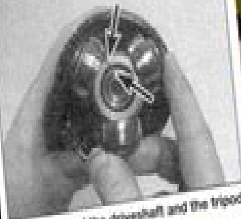
2.5b .... and the driveshaft and the tripod joint