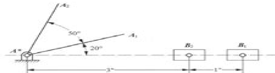
Figure P2-1.1 Original drawing for Problem 2.1.

A slider crank mechanism is to move the slider 1" for 40° of rotation of the crank as shown in the figure. Using GCP methods, develop a graphical solution to determine the necessary crank and coupler lengths. Explicitly identify the layer structure used, and make a separate layer for all possible input dimensions. Also, explicitly list the driving and driven variables. Show the use of your graphical program to resolve the problem when the slider distance is 1.5 in and the crank rotates through an angle of 60°