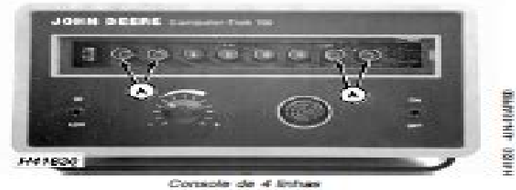
Console de 4 linhas

Para um monitor de 4- linhas, remova duas lâmpadas (A) de cada extremidade.