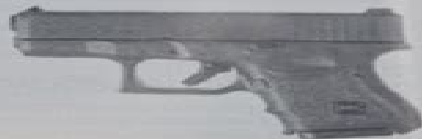
GLOCK 26, 27