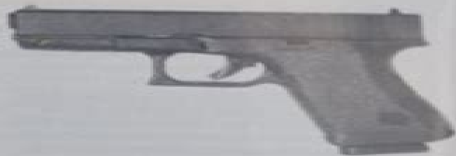
GLOCK 19, 23, 25