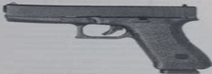
GLOCK 17, 22