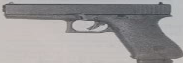
GLOCK 20, 21