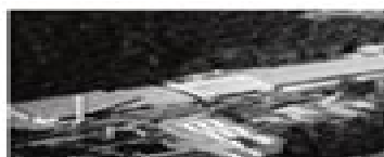
ELGIN SA Fábrica - AP

Conquistando pelo segmento das máquinas de costura, a ELGIN S.A. foi fundada em 1952, torna empresa familiar com capital 100% nacional, possui 2 plantas, Fábrica Elgin Mogi das Cruzes e 1 em Pirassol, além de 1 escritório central em São Paulo e mais 50 lojas de assistência, contando com mais de 1.200 colaboradores. Presente em diversos ramos diferentes da atuação, com uma variedade de mais de 1.200 produtos cadastrados e mais de 25 áreas de suporte e assistência: 0800 0000 0000.