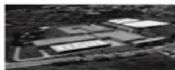
ELGIN SA Fábrica das Chuvas - SP