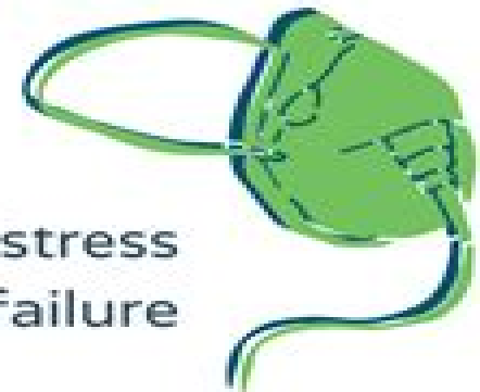
Resp. distress vs. failure