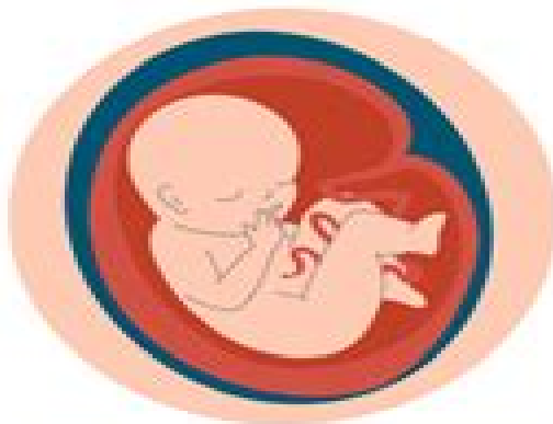
OB and neonatal resuscitation