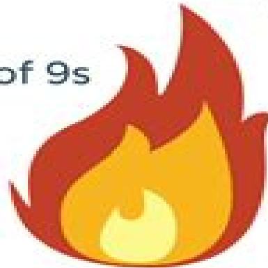
Rule of 9s