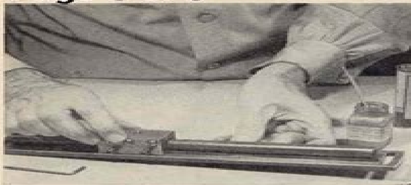
4. SLIDE BLOCKS should be lapped after reaming to assure smooth operation. Drill-rod track is coated with lapping compound. Block is stroked by hand

from a short length of heavy steel angle or can be made by welding two pieces of \frac{1}{2} -in. flat steel at a 90-degree angle. The bracket is screwed to the flat on the back face of the lathe carriage, Fig. 5. The dimensions on the angle bracket carrying the V-way clamp, Fig. 6, also should be checked with your lathe before cutting stock. The lower track, Figs. 5 and 8, should be parallel with the lathe ways.